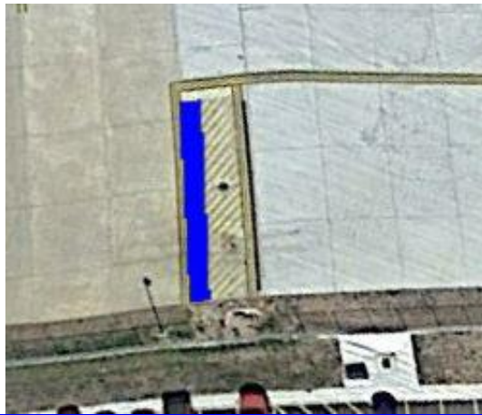
❖ Commercial Ramp Lav Dump: 275 SqFt