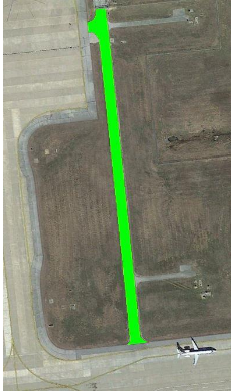
❖ Fuel Farm Road: 24,010 SqFt