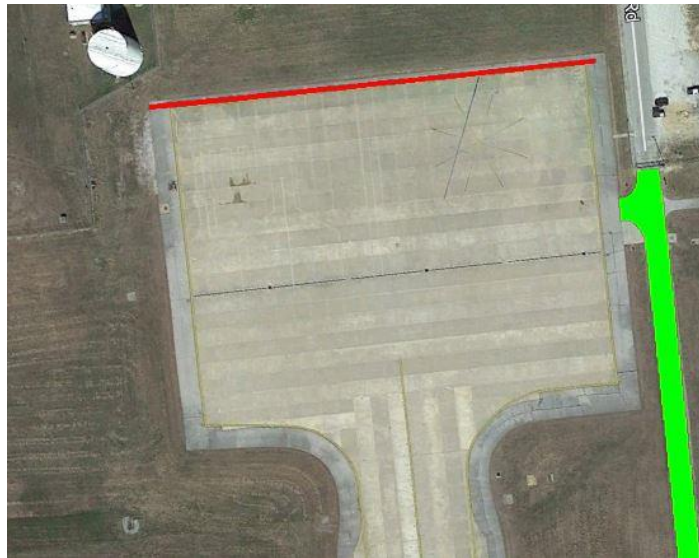
❖ North Cargo Ramp: 5,616 SqFt