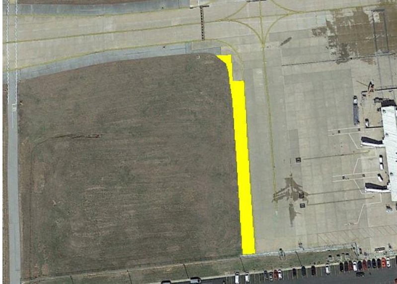
❖ Commercial Ramp South of Foxtrot: 8,625